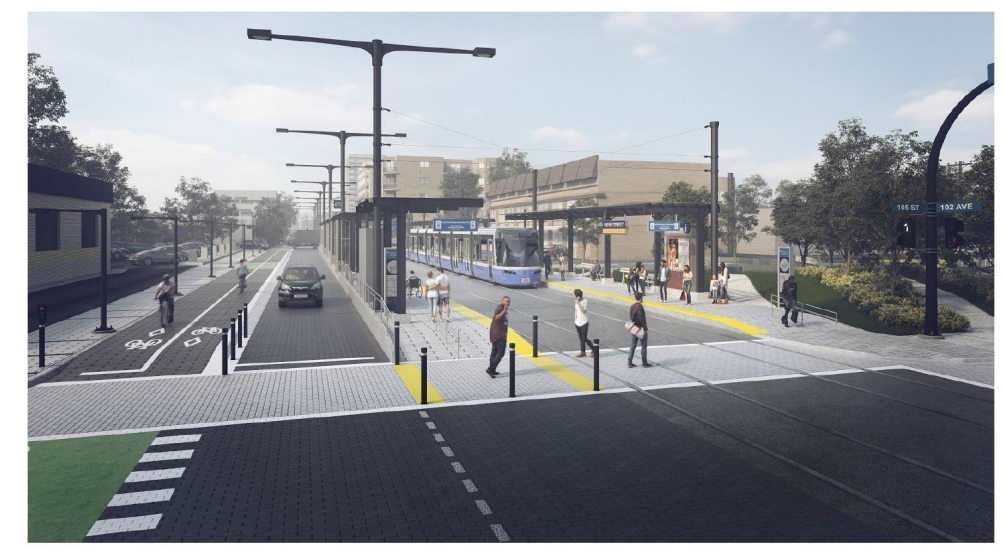
An artist's rendering of the Alex Decoteau Stop

crossing Anthony Henday Drive at 87 Avenue