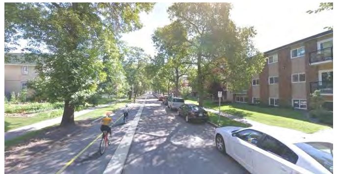
83 Avenue near 105 Street: After

A cycle track will run on the north side of 83 Avenue from 111 Street to 99 Street. From 99 Street to 96 Street, the route has been constructed as a bike boulevard and the east end of the bike route will connect to a shared-use path on 95 A Street.