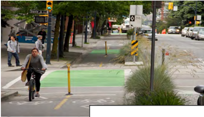
Cycle Track (example from Vancouver)