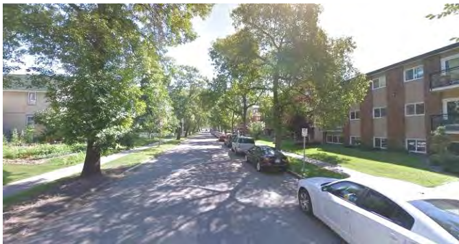
83 Avenue near 105 Street: Before

The majority of the bike route will feature a cycle track design, otherwise known as a protected bike lane, which physically separates motor vehicle traffic from parked cars and sidewalks. It creates a safe cycling environment and minimizes conflicts between cyclists, pedestrians and drivers.