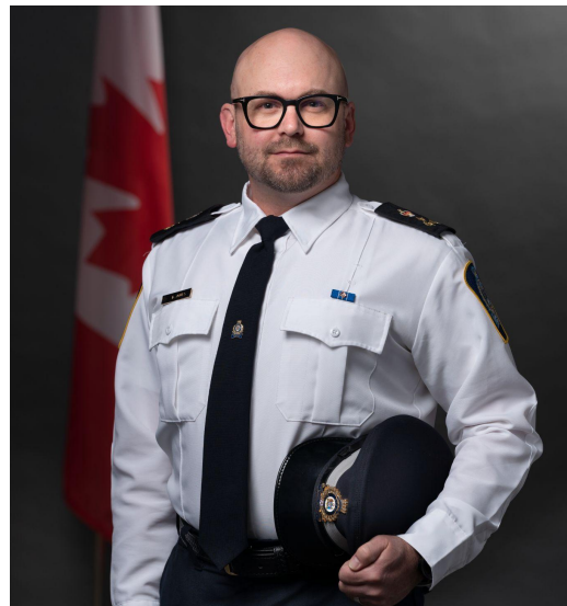
David Jones Community Standards