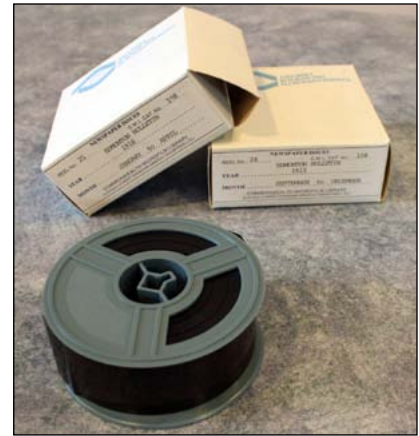
The Edmonton Archives has an extensive microfilm collection.