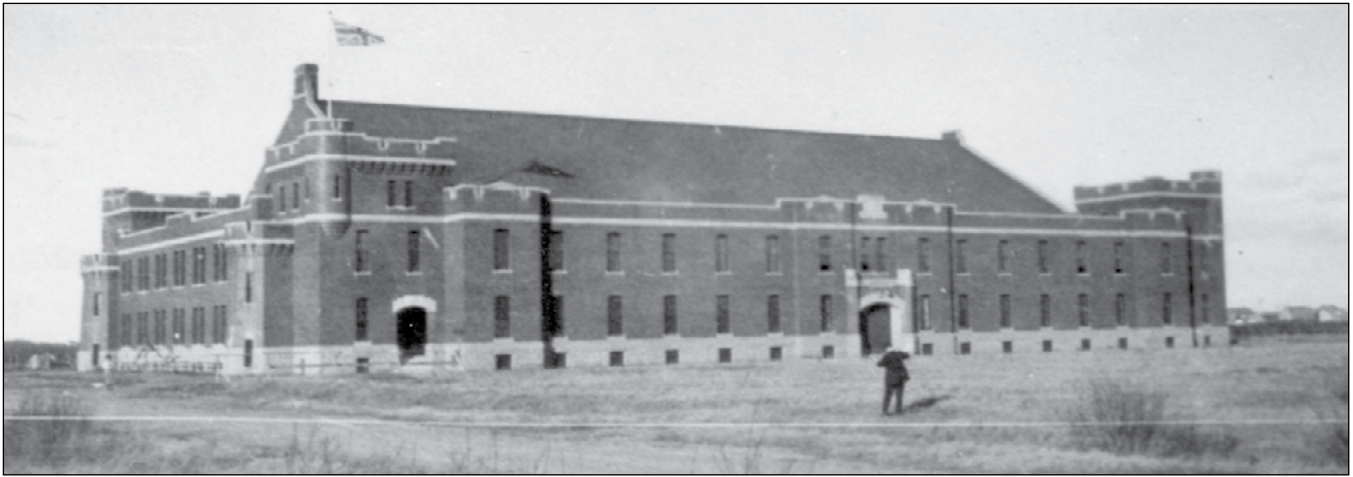
A man stands in front of the Prince of Wales Armouries ca. 1915 in one of the archives' earliest photos of the building.