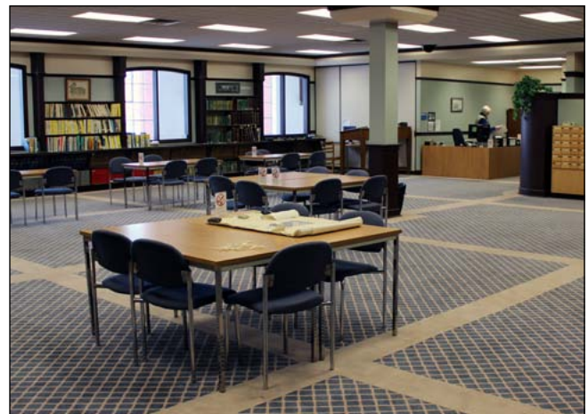
Reference Room at the City of Edmonton Archives.

It's a good idea early in the process to ask neighbors what they know about the history of your property. They may also know of long-term residents in the area who may remember former owners or tenants of your home. You can also check with your community association to see if a local history has been written, which may contain information on former residents. Finally, consider putting a notice in your community newsletter asking people with knowledge of local lore to contact you.