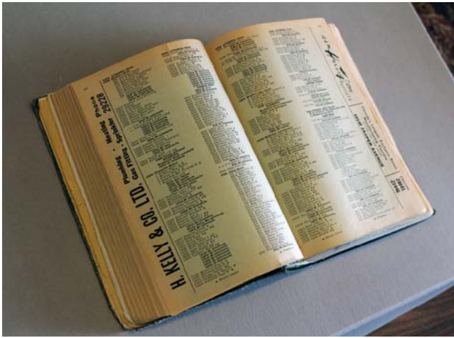
A Henderson's Directory on display.