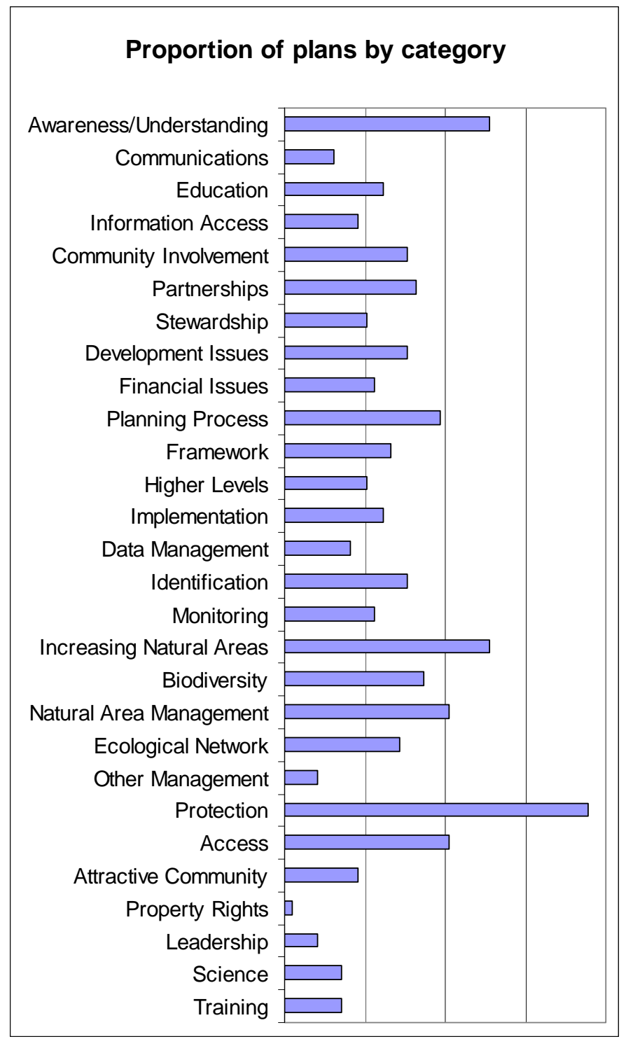
Figure 1: The proportion of plans (out of 49) represented in each category

The following figures (Figures 1 and 2) illustrate the patterns summarized in Table 2 as well as the proportions of the plans by all of the categories and themes.