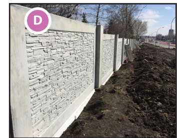
Noise Wall Installations along 66th street (TransEd)