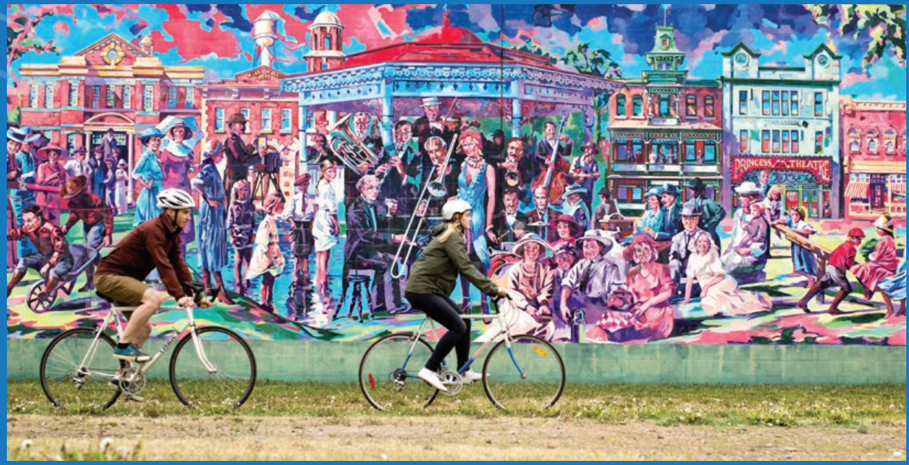
Old Strathcona Mural