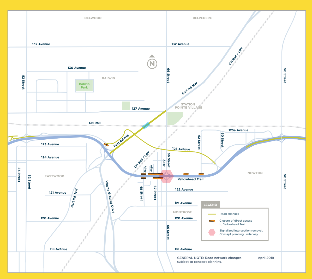
FIGURE 1: PROJECT AREA MAP

The outcome of the study will be a concept plan for the roadway network in the area. No decisions have yet been made, aside from the broader objective of being able to achieve free–flowing traffic (no traffic signals) on Yellowhead Trail.