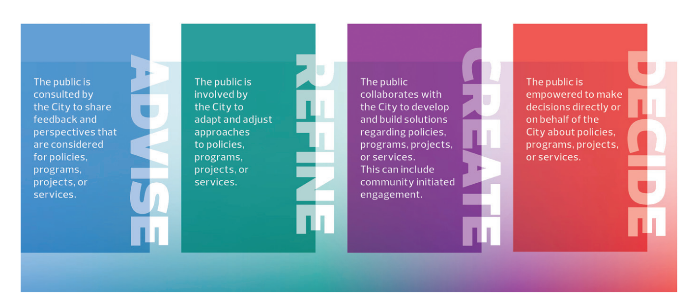
FIGURE 2: PUBLIC ENGAGEMENT SPECTRUM

The City's public engagement spectrum defines the public's level of influence in engagement processes.