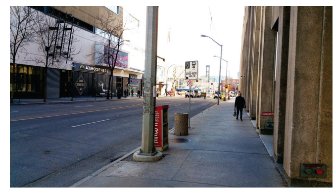
Current view of 102 Avenue (looking eastbound from 100A Street).