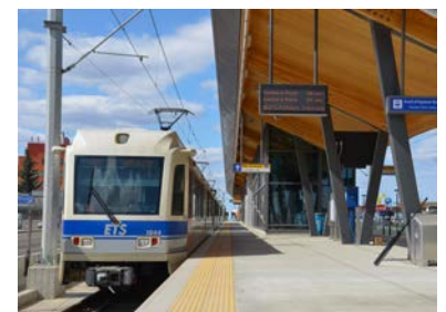
Kingsway/Royal Alex Station