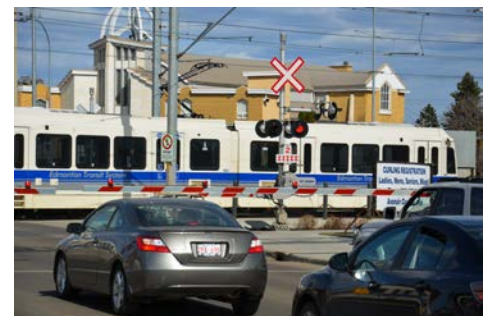
Train crossing at 106 Street & Princess Elizabeth Avenue