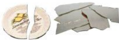
Broken Glass, Mirror and Plates