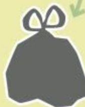
Bag dusty items.