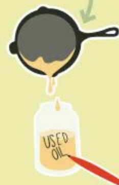
Store used cooking oil in a container under 1 litre.