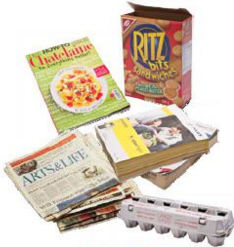
Paper and Boxes