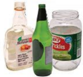
Glass Jars and Bottles