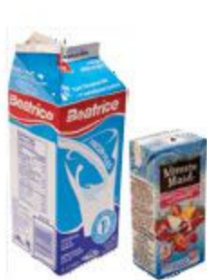
Milk Cartons and Juice Boxes