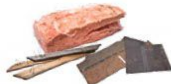
Loose or Mixed Waste

For information on fees visit edmonton.ca/ecostations