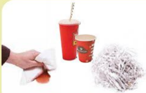
Disposable Cups and Plates, Shredded Paper and Tissue Paper