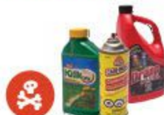
Poisonous and Corrosive Materials