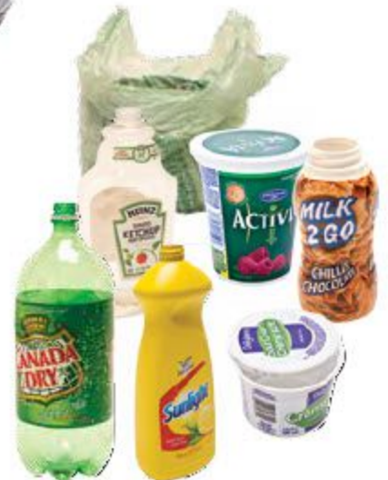
Plastic Containers and Bags