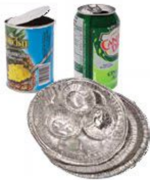
Metal Cans and Aluminum Trays