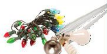
Light Bulbs and Fluorescent Tubes