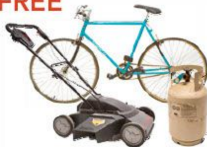
Scrap Metal and Electronic Waste