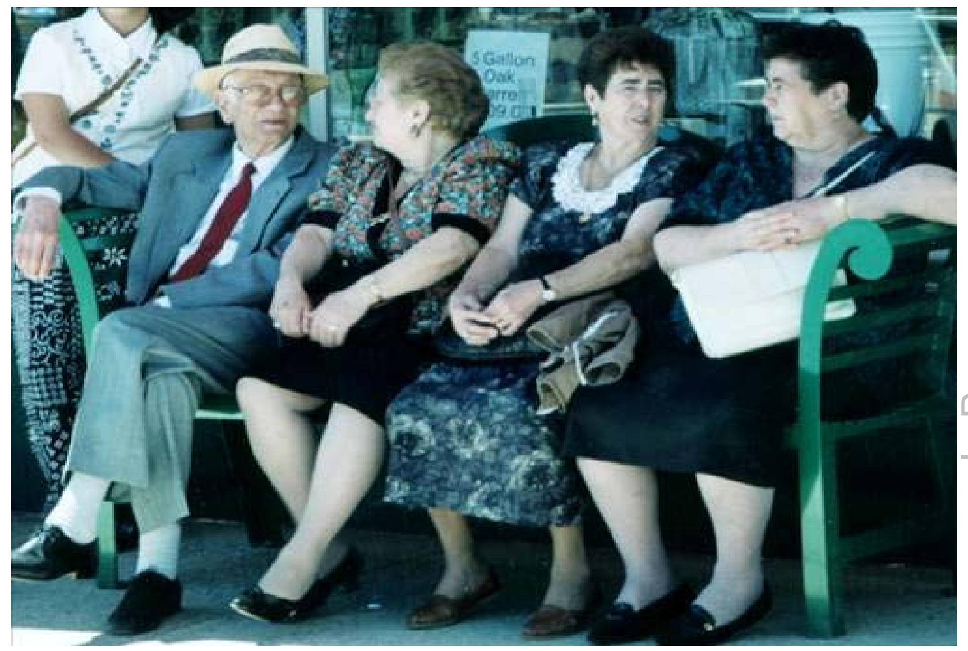
"What is the city but the people" - William Shakespeare