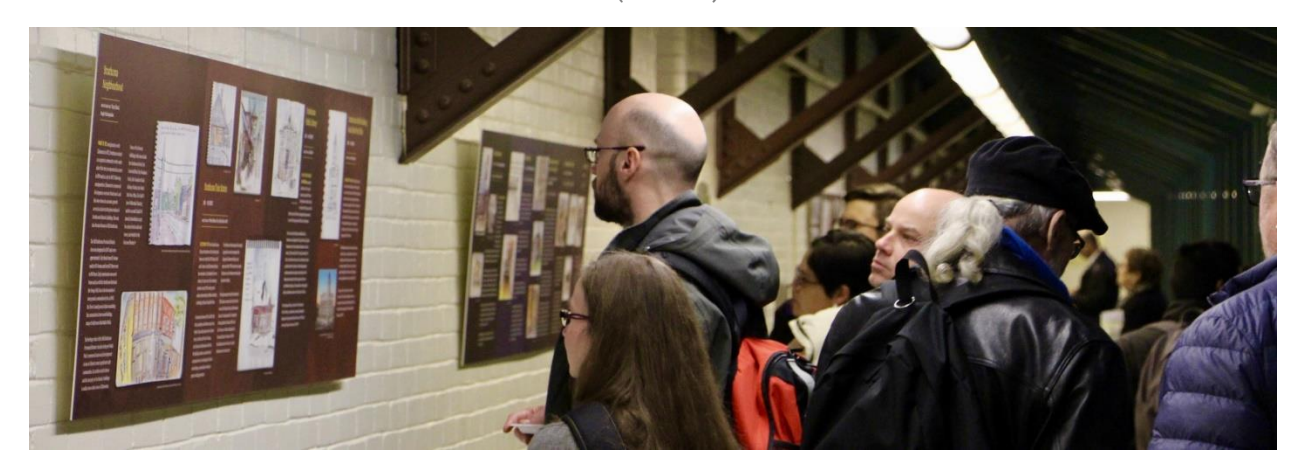
Visitors at opening of Sketching History exhibit