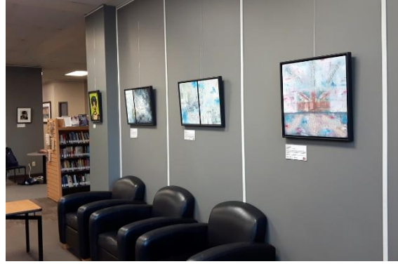
Exhibit in place at Concordia University