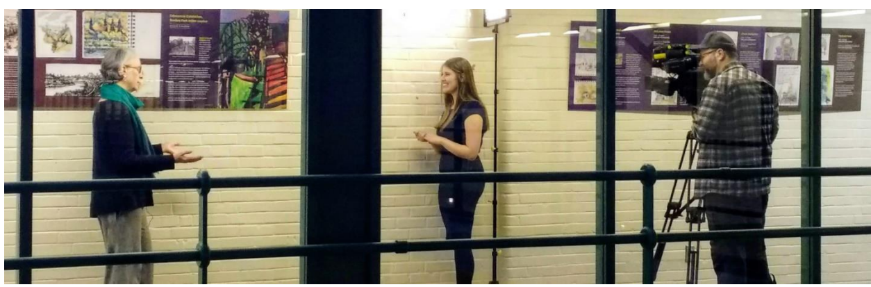
Global TV interviewing me at the Sketching History exhibit