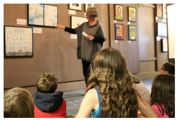
Artist's talk at Millet Museum & Archives