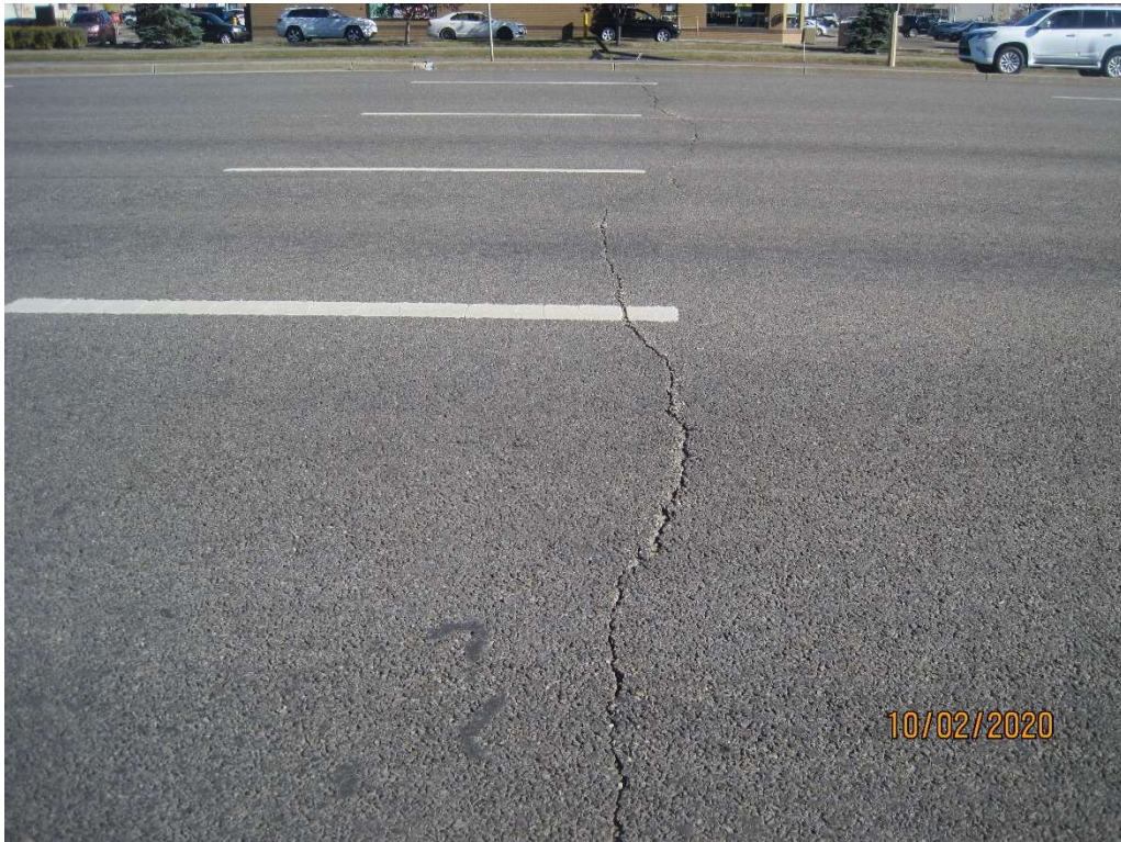
Photo 13: 97 St NW (NB) at 160 Ave, Transverse crack, looking east