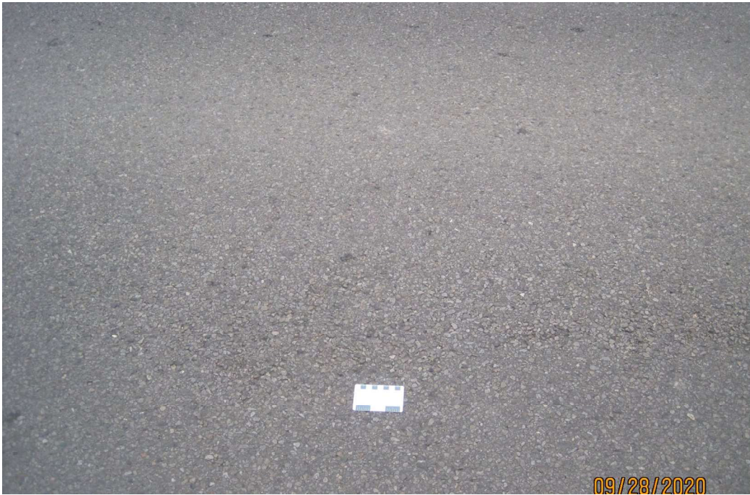
Photo 10: 111 Ave NW at 125 St, Pavement condition at segregated area, close-up