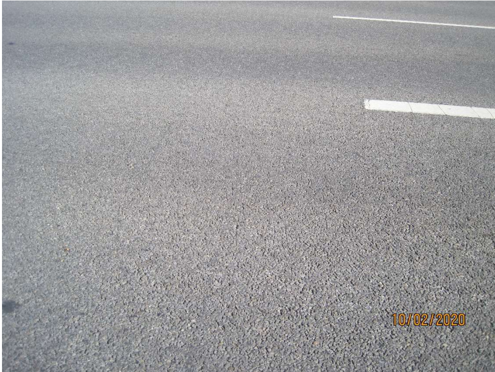
Photo 15: 97 St NW (NB) at Griesbach Rd, General pavement condition, close-up