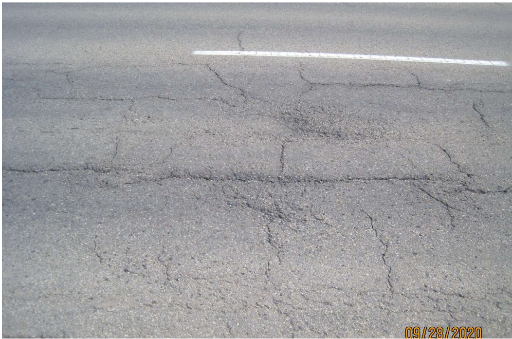
Photo 6: 178 St NW at 93 Ave—General pavement condition, looking east