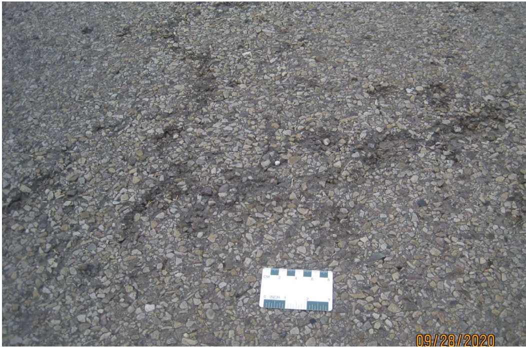
Photo 1: 122 St NW at 62 Ave–Pavement condition at segregated area, close-up