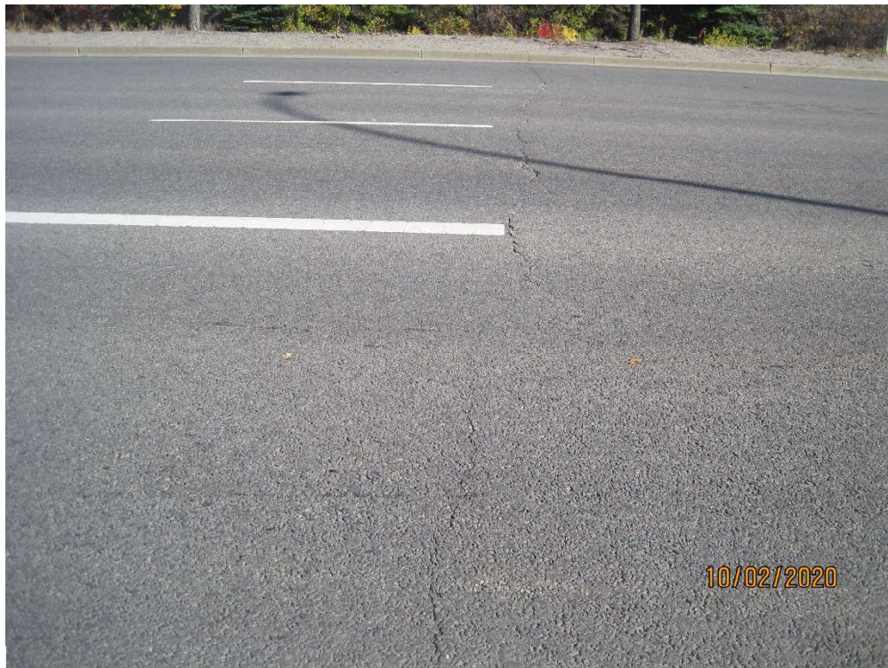
Photo 14: 97 St NW (NB) at Griesbach Rd, Transverse crack, looking east