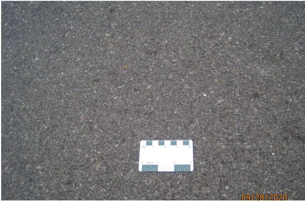
Photo 3: Groat Road at 89 Ave, General pavement condition, close-up