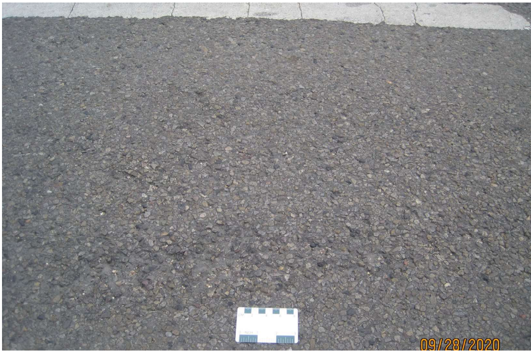
Photo 8: 111 Ave NW at 129 St, Pavement condition at segregated area, close-up