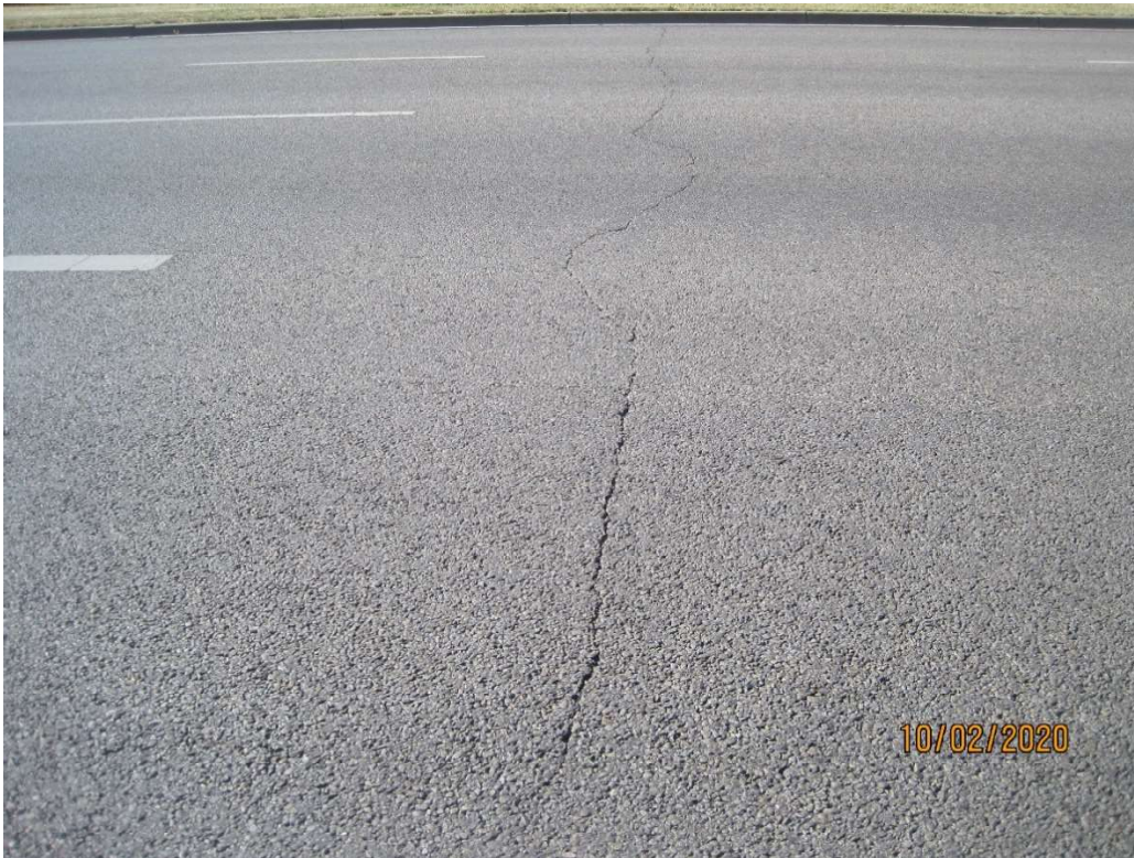
Photo 11: 97 St NW (NB) at 153 Ave, Transverse crack, looking west