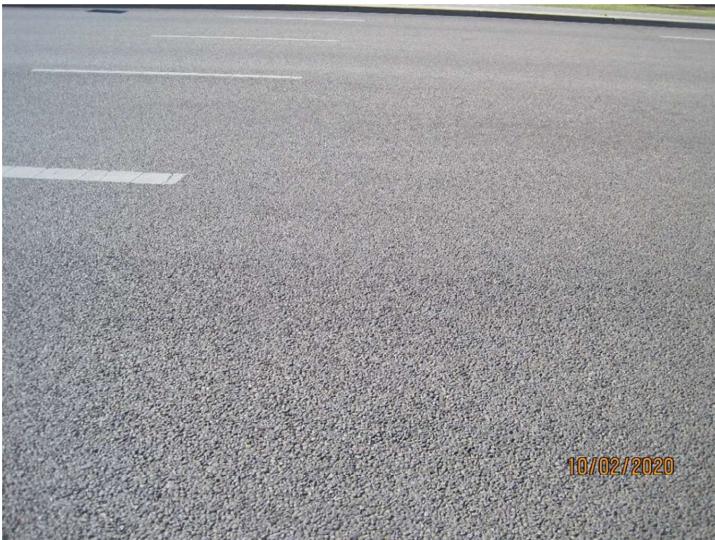
Photo 12: 97 St NW (NB) at 165 Ave, General pavement condition, close-up