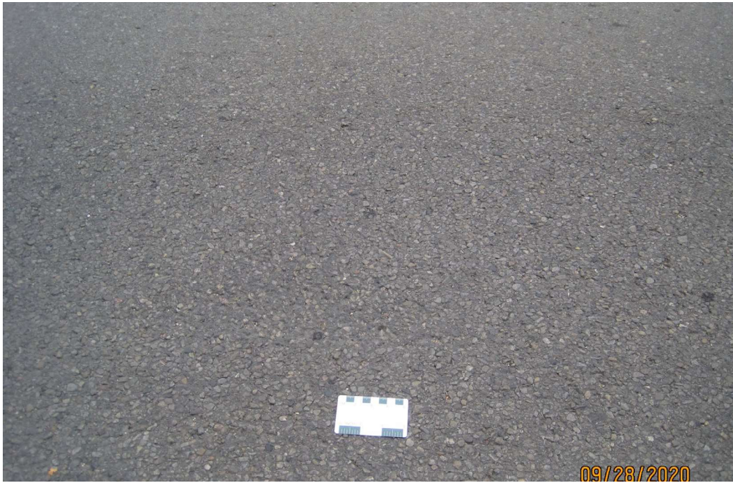
Photo 7: 111 Ave NW at 130 St, General pavement condition, close-up