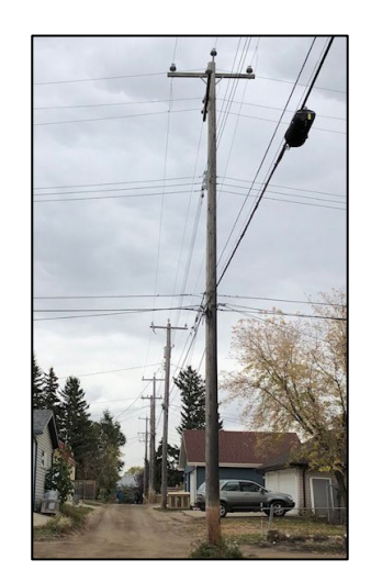
If your alley currently has poles but no lighting:

Residents can add lights to poles through the Local Improvement Program