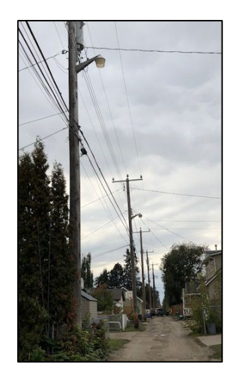
If your alley currently has lighting: