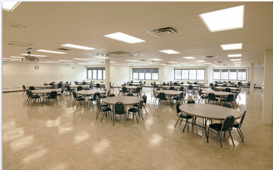
ACT MAIN HALL

Includes: Resound and Socan Fees and onsite Event Hosts