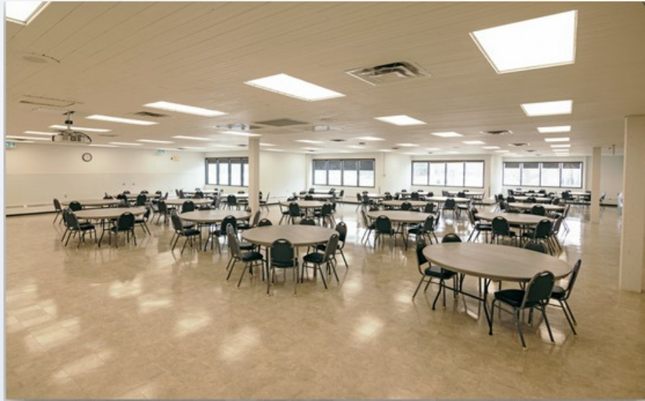
ACT MAIN HALL

Additional Fees will apply for Resound and Socan and onsite Event Hosts