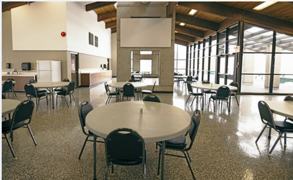
RUNDLE FAMILY CENTRE

Additional Fees will apply for Resound and Socan and onsite Event Hosts