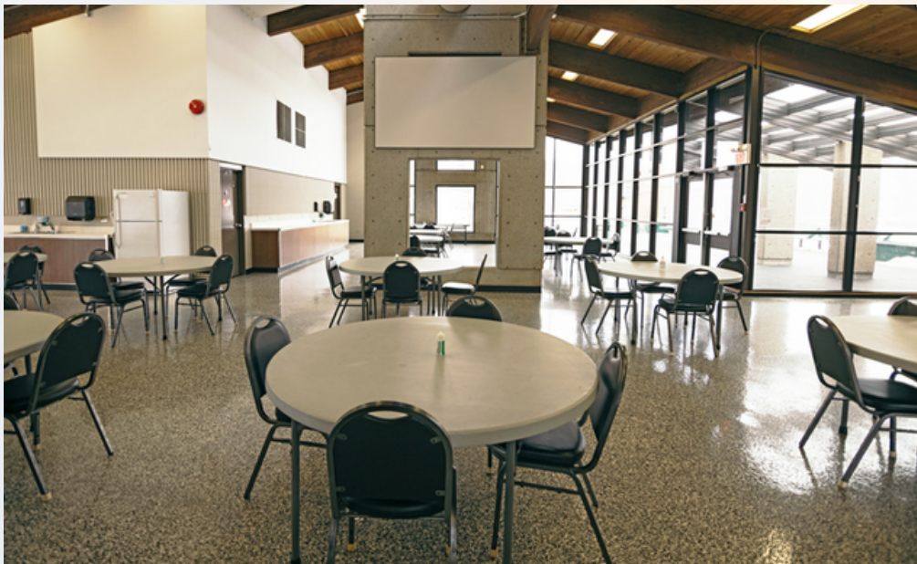
RUNDLE FAMILY CENTRE

Includes: Resound and Socan and onsite Event Hosts