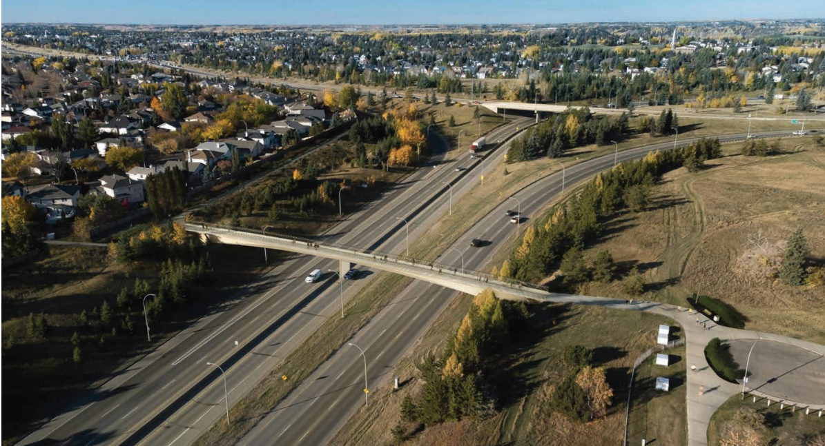
Rendering of pedestrian / cyclist bridge over Whitemud Drive facing west.

The new pedestrian / cyclist bridge will cross Whitemud Drive and provide a connection between the neighbourhoods of Brookside and Brookview at 142 Street.