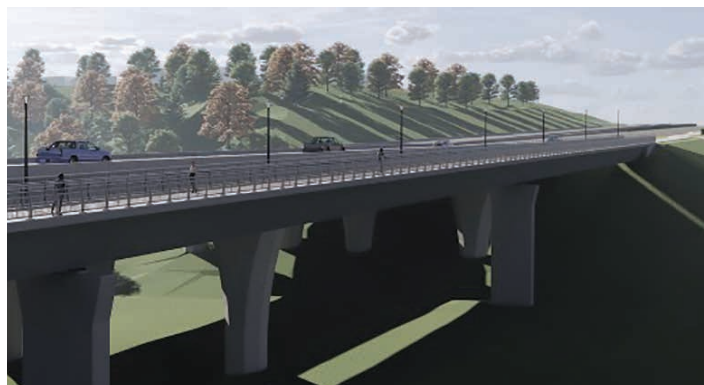
Rendering of future Rainbow Valley bridges facing west.