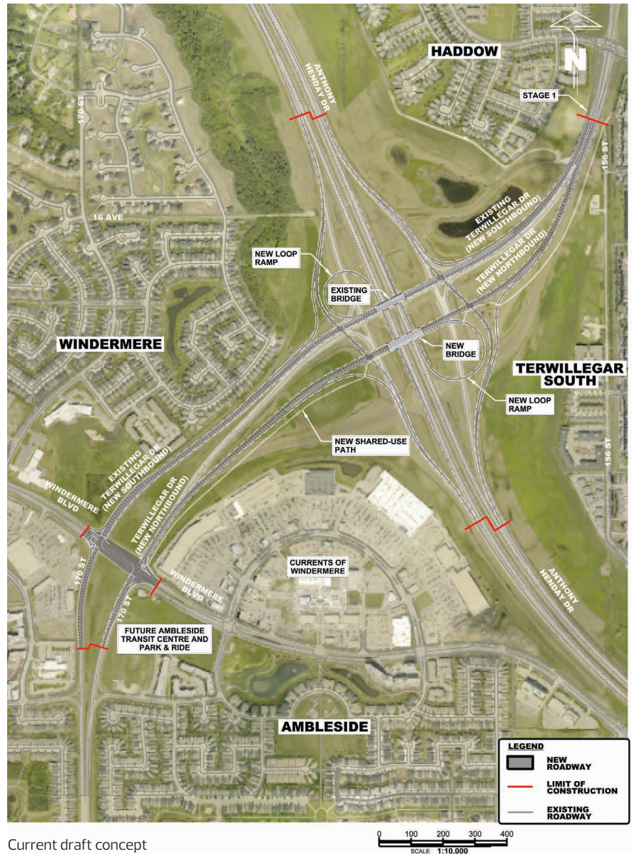
Current draft concept

Attend our upcoming Online Presentation and Live Q&A on April 26, 2022, to learn more and provide your thoughts on the active transportation and transit connections through our online survey at edmonton.ca/TerwillegarDrive live April 26 to May 17.