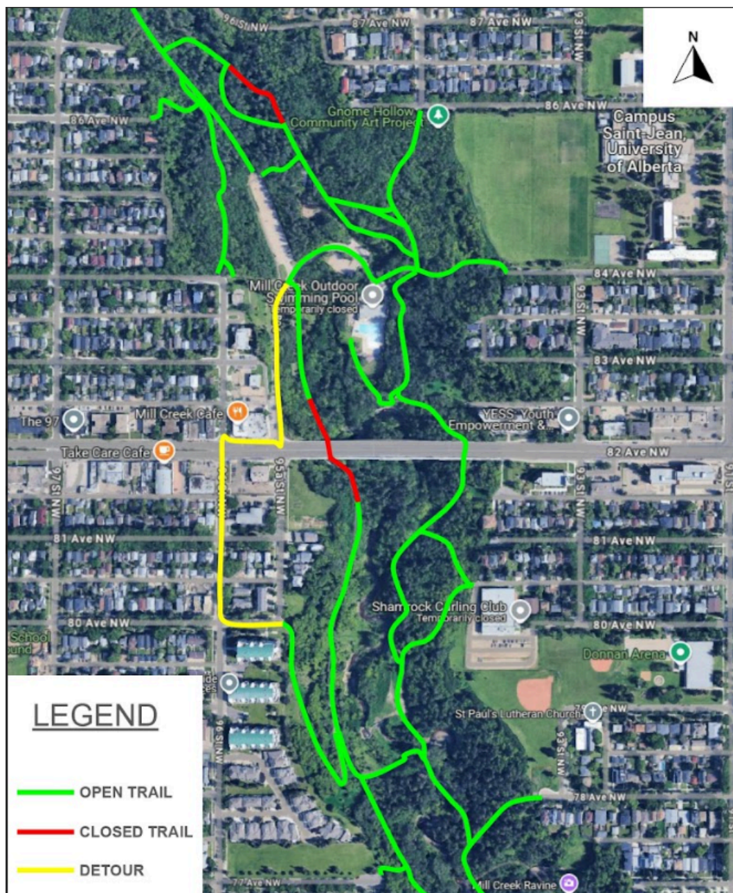
Image 2 (below)- Map of the Mill Creek Ravine Trails, including path closures, rough location of open gravel trails and detour