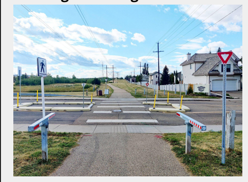
Two-stage Crossing with corresponding curb extensions