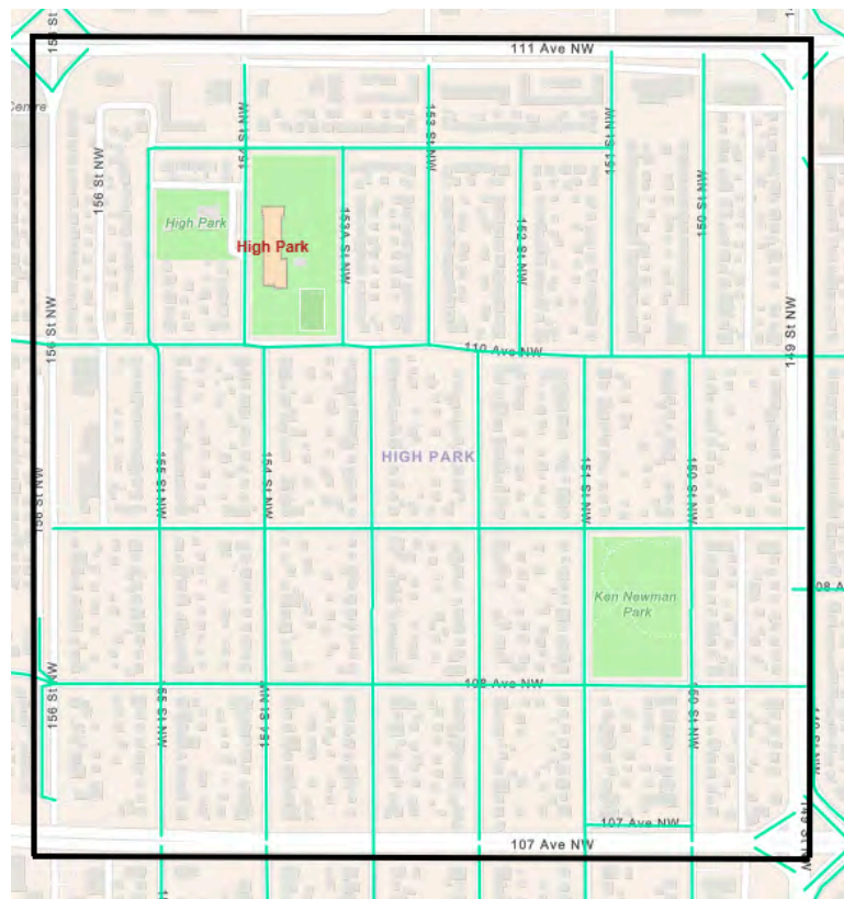
Map Legend: Roads In Project Scope

Local Roads are low volume roads which typically provide access to local properties.