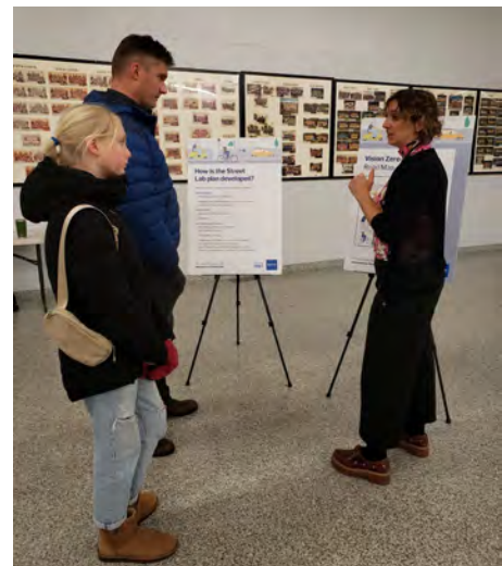
Photos from the in-person engagement event held on November 19th.