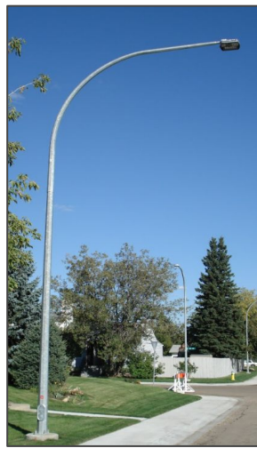
Standard galvanized, no cost