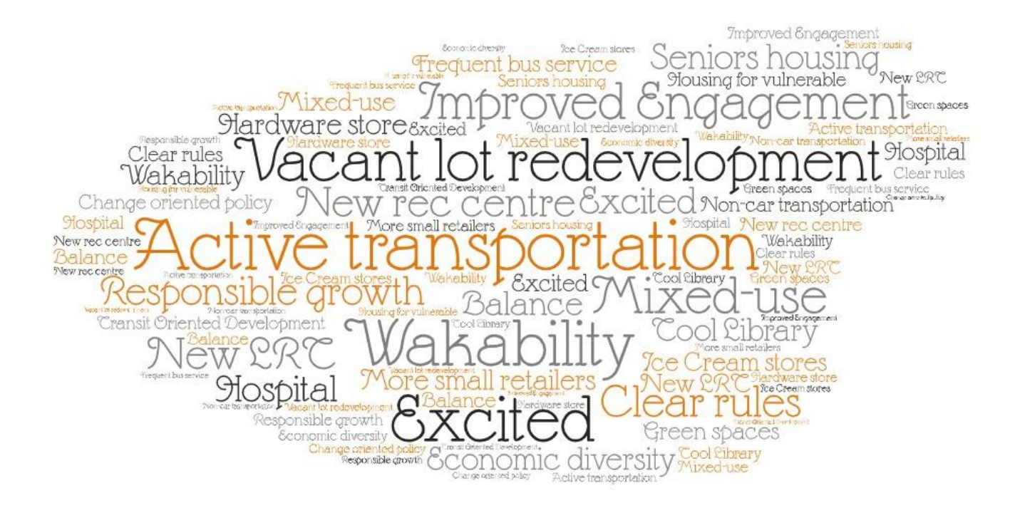
Figure 4: "What are you excited to see happen in your district as Edmonton grows to 1.25 Million people?"