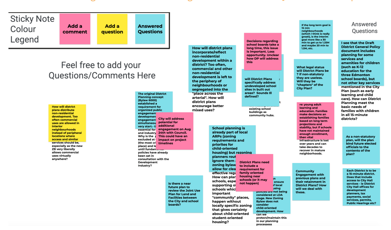
Figure 1: District Planning Information Session Jamboard Example

The format included a brief presentation by 1-2 members from the project team, a check in and check out ice-breaker, and opportunities for questions or comments. During each session, all questions and comments were captured on a "Jamboard" with "post-it notes" either by a facilitator or the participants themselves. Following the session, participants were provided a survey to provide feedback on the session's format.