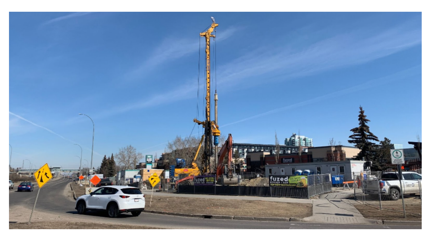
(northeast corner of 23 Avenue and 111 Street)