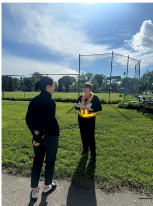
Project team at Allin Park

A total of 74 people completed the online survey. The majority of survey respondents (80 per cent) were from Glenwood and neighbourhoods near