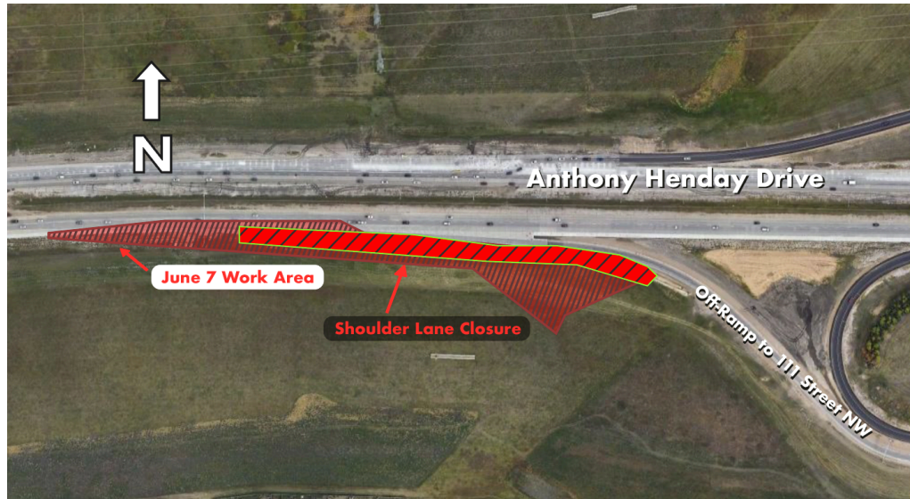
Map 2: Eastbound median lane closures (Phase 1)