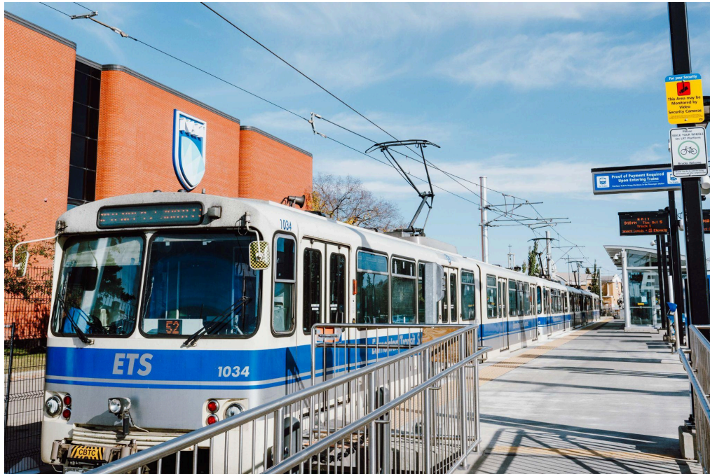
Former NAIT LRT Station

Beginning on/around April 8 , PCL, the City's contractor, will begin demolishing the former NAIT LRT station. The demolition is anticipated to take two months and will occur overnight (8:00 p.m. to 5:00 a.m.) in phases to reduce the impact on LRT riders. Overnight work will occur periodically (during weekdays and two weekends) and will require the use of heavy equipment to jack hammer the concrete at the station. PCL has obtained an overnight noise permit (BYLAW NO. 14600) allowing them to work during overnight hours.