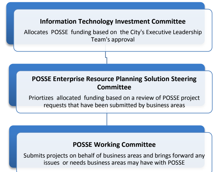
Figure 1: Committee's in POSSE's Governance Structure

Figure 1 illustrates the committees in POSSE's governance structure: