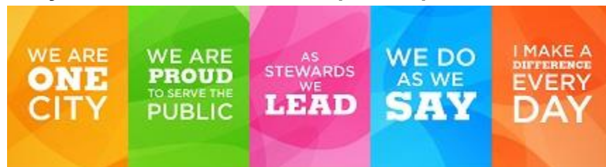
Figure 1: The City of Edmonton’s Leadership Principles

By initiating this proactive Fraud Risk Management project, the OCA wants to empower employees to demonstrate the leadership principles: “We do as we say”, which means we lead by example, walk the talk, are accountable, trustworthy and honest, and “I make a difference every day,” which is about individuals making a difference no matter where they are in the system.