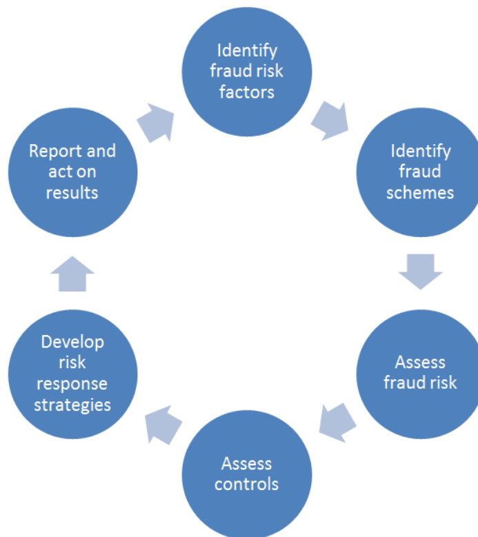
Figure 3: High-level Fraud Risk Assessment Process

To assist business units in conducting fraud risk assessments, the OCA developed a fraud risk assessment toolkit. The toolkit consists of: