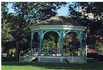
Dick Mather Gazebo

Park staff will post signage at the gazebo up to half an hour prior to your start time on the day of your reservation. This lets other park users know that you have reserved the gazebo. A member of your group may wish to arrive 15 minutes prior to your event starting. Do not leave any items unattended.