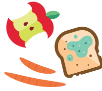
Table scraps, peelings, leftovers, spoiled food, etc.

Every week in the spring, summer and fall, and every 2 weeks in the winter.