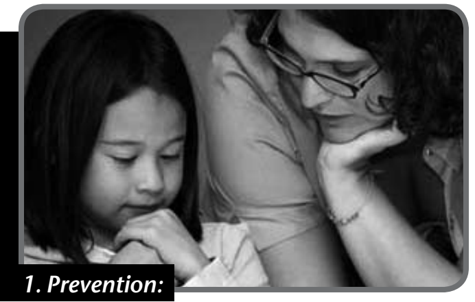
Avoid or delay misuse by reducing risk factors, enhancing protective factors and enabling citizens to develop competence and resilience from an early age.

Effective drug strategies around the world stand on a comprehensive base addressing four pillars: prevention, treatment, harm reduction and enforcement. Edmonton also pursues this balanced and multi-faceted approach.