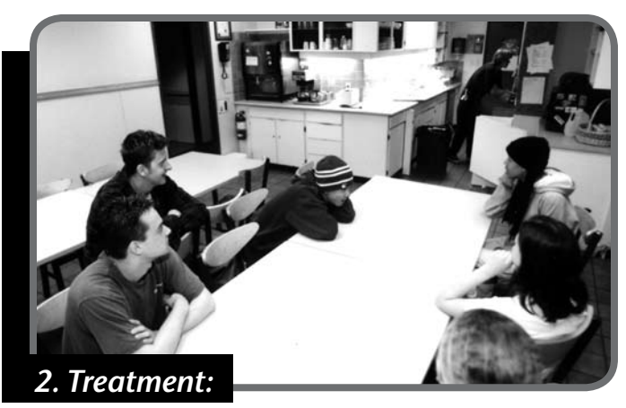
Provide access to a continuum of treatment services that help people in the grip of alcohol or other drugs deal with root problems, regain health and avoid recurrence.