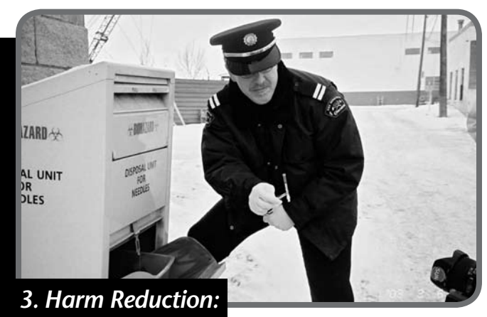
Recognizing that it is impossible to eliminate all substance use, minimize the resulting harm by addressing pressing health, social and economic challenges.