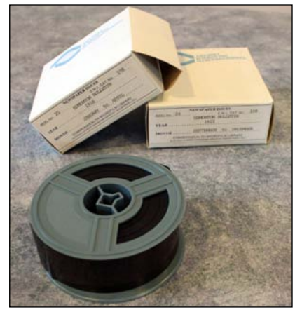
The Edmonton Archives has an extensive microfilm collection.