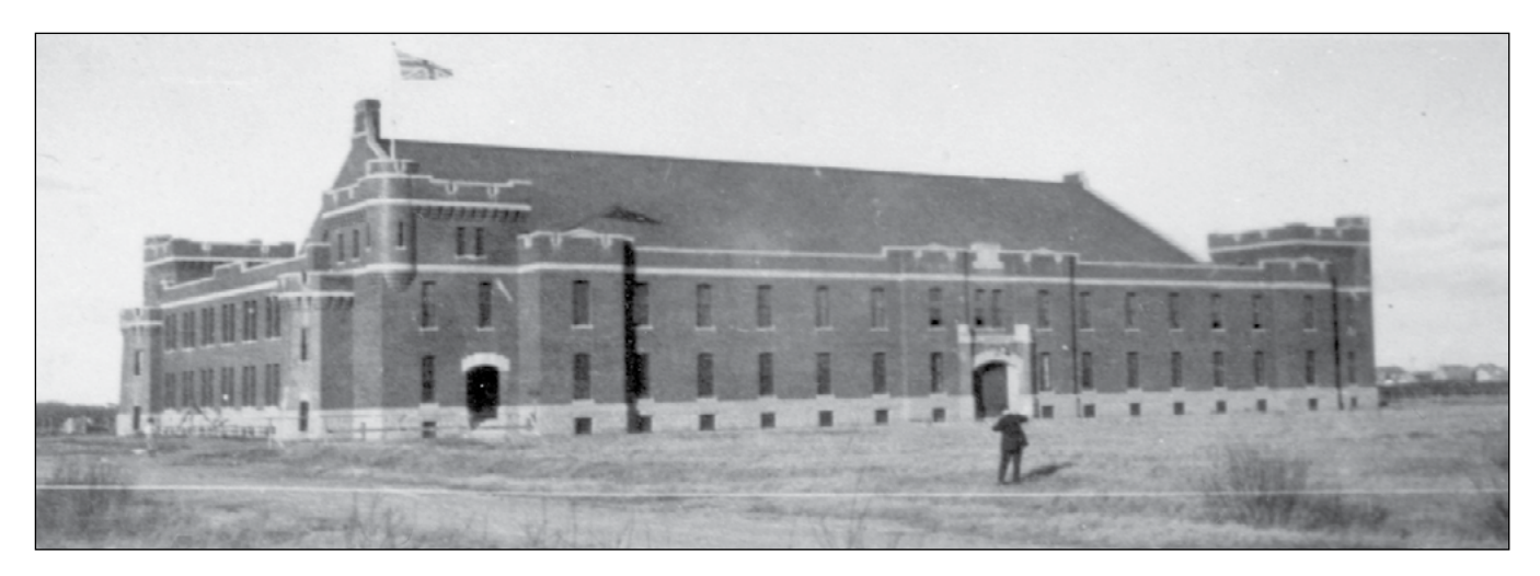
A man stands in front of the Prince of Wales Armouries ca. 1915 in one of the archives' earliest photos of the building.