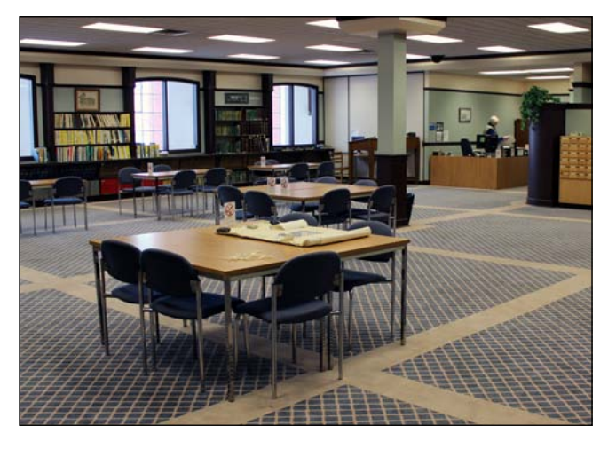
Reference Room at the City of Edmonton Archives.

It's a good idea early in the process to ask neighbors what they know about the history of your property. They may also know of long-term residents in the area who may remember former owners or tenants of your home. You can also check with your community association to see if a local history has been written, which may contain information on former residents. Finally, consider putting a notice in your community newsletter asking people with knowledge of local lore to contact you.