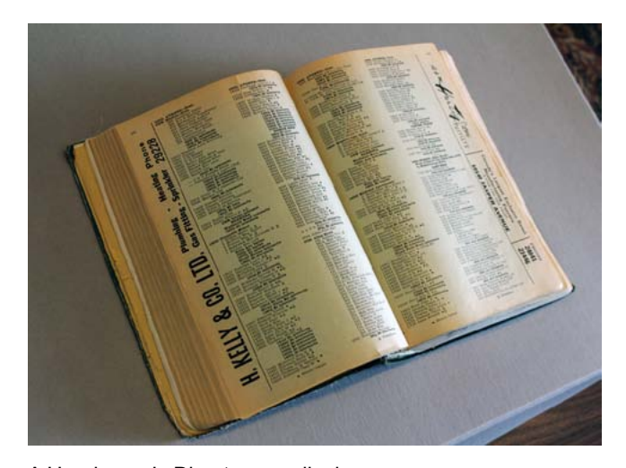
A Henderson's Directory on display.