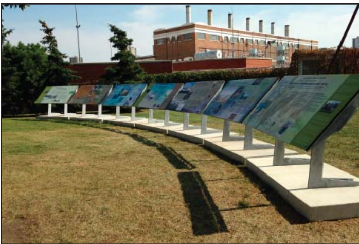
Interpretive Belvedere in its temporary new home.

The installation of the support structures was completed in mid-august, and the information panels were installed on August 19.