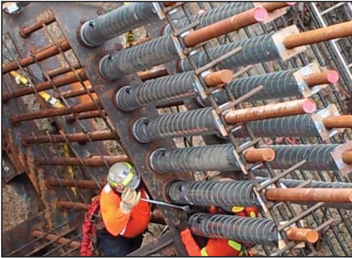
Crew member working on anchor rods.