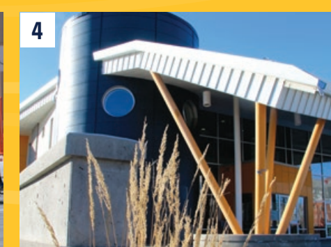
4 Boyle Street Community Plaza is a community hub in the heart of the Boyle Street neighbourhood.