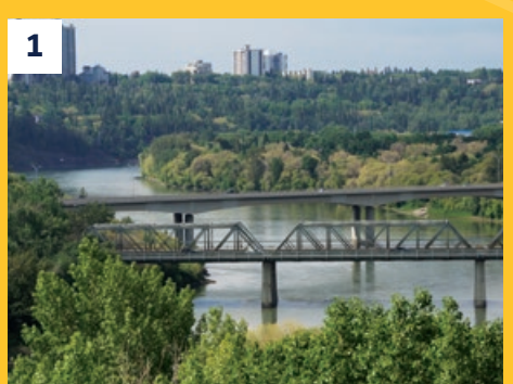
1 A view of the North Saskatchewan River from Boyle Street. Edmonton's River Valley is the largest urban park in Canada, with more than 160 kilometres of maintained pathways.