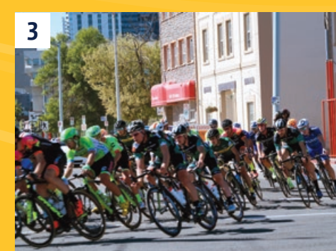
3 Cyclists pedal through Boyle Street's Quarters district during a province-wide race. The area has become a hotspot for festivals and major events.