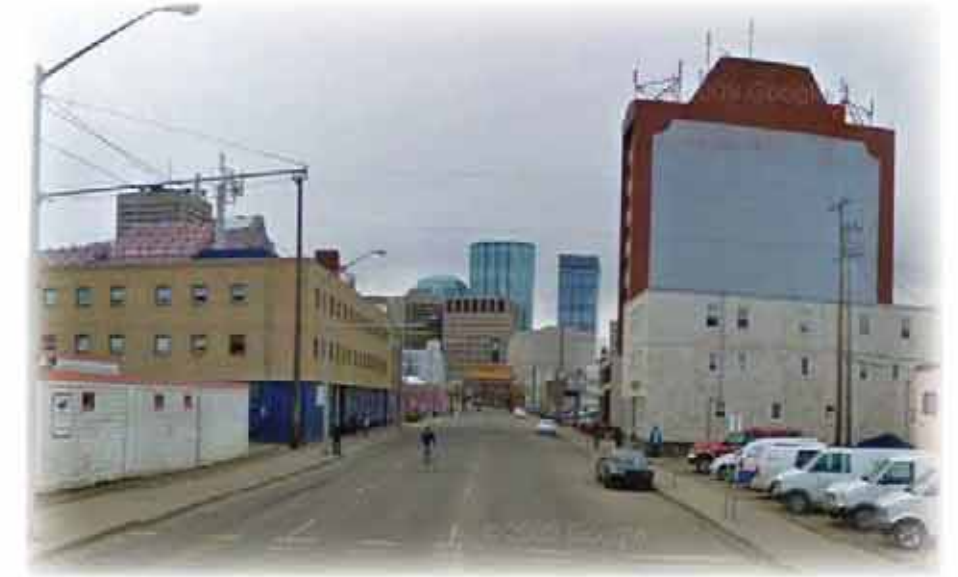
Existing Conditions (Looking west)