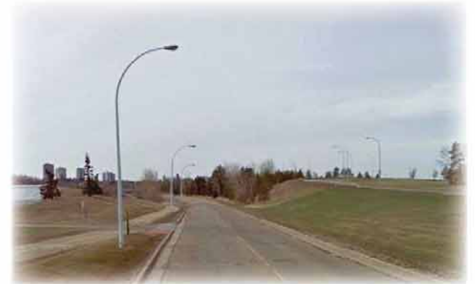
Existing Conditions (Looking southwest)

(Based on your feedback, elements selected for project will be similar to images above.)