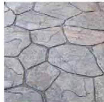
Paving (Patterned Concrete)