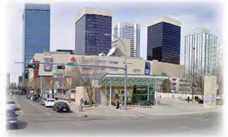
Existing Conditions (Looking west)

(Based on your feedback, elements selected for project will be similar to images above.)