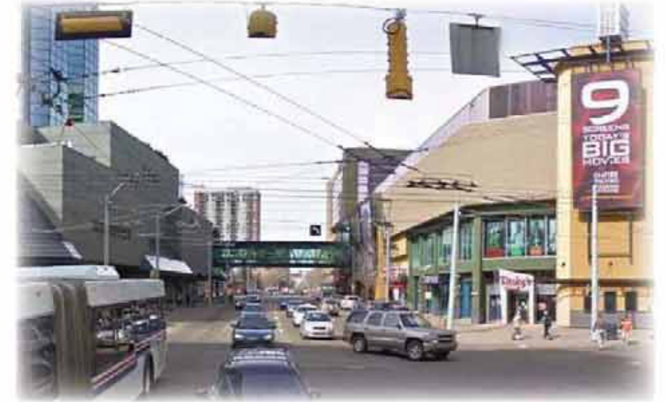
Existing Conditions (Looking west)