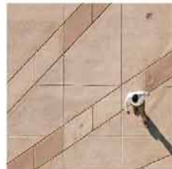
Paving (Patterned Concrete)