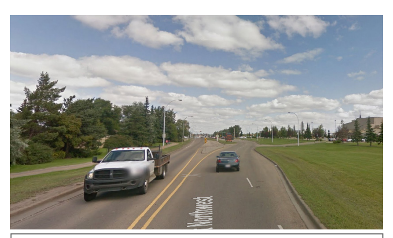
66 Street as it transitions from a two-lane to a fourlane roadway just south of 23 Avenue.